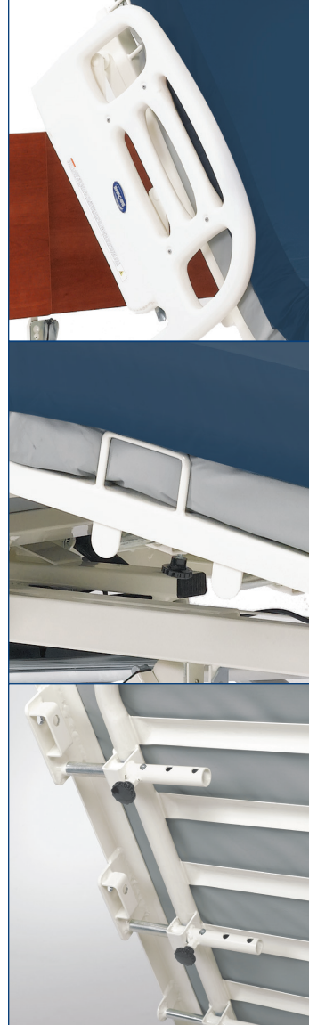
CS9 FX600 bed featured with Invacare® ThinkSoft® Positioning Device, Kendall Bed Ends and Invacare® Solace® Mattress

The innovative Carroll CS Series™ CS9™ FX600 Adjustable Width Bed adjusts from 36" to 39" or 42" to accommodate a variety of residents including those up to 600 lb., offering facilities the utmost in flexibility and providing a total solution for any long-term care facility. Matching the look and feel of the entire CS line, this FX600 is a bariatric bed that blends in with the others, bringing dignity to the resident. The optional trendlenburg option makes this bed a true solution in every wing of the facility.